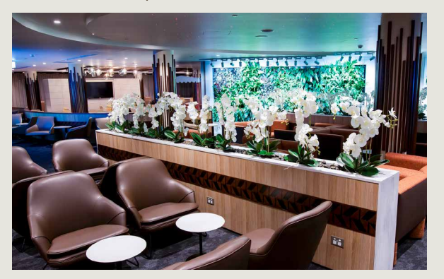
Foreign Language Concierge