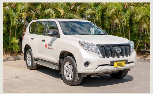
24-Hour Customer Care