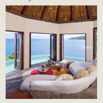
Groups & Events