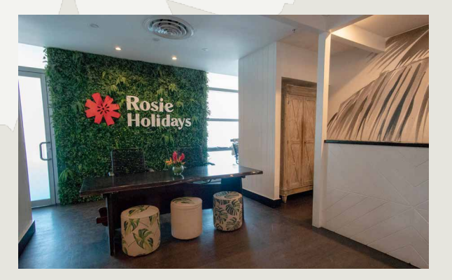
24-Hour Airport Services